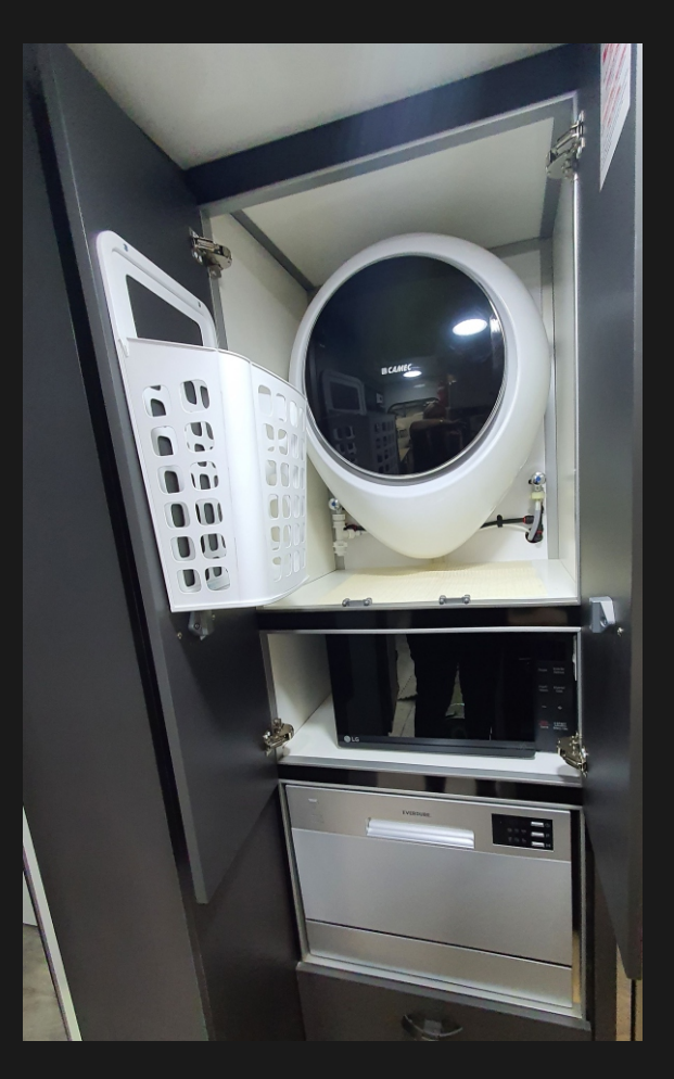
Life on the road with a washing machine, microwave and dish washer gives you the freedom to camp anywhere.