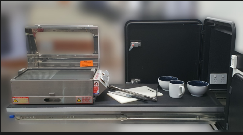
Outdoor entertaining is made easy with our external barbecue slide out range with high quality commercial stainless steel that stows away after use.

A rearview camera system provides assistance when parking or reversing at campsites, petrol stations, rest stops, and more. Making life on the road easier