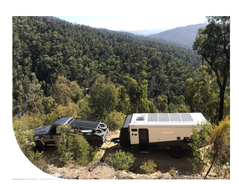
Travel Anywhere with a Trailblazers Hybrid Camper...